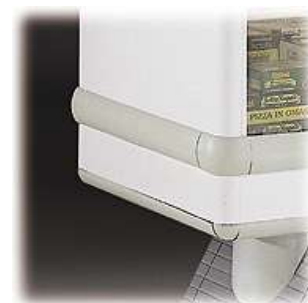
bumper in PVC