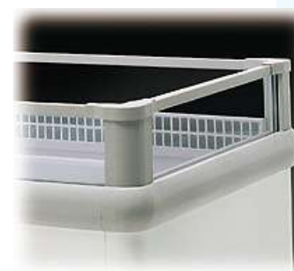
Profiles and bumpers in PVC