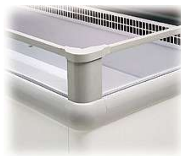
Upper in tempered glass