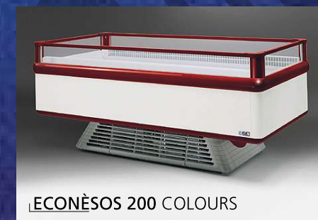
ECONÈSOS 200 COLOURS