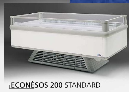
ECONÈSOS 200 STANDARD