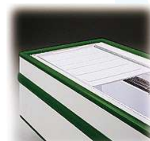
Night covers in ABS