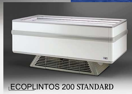
ECOPLINTOS 200 STANDARD