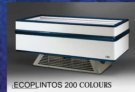
ECOPLINTOS 200 COLOURS