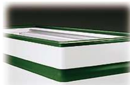
Profiles and bumpers in PVC