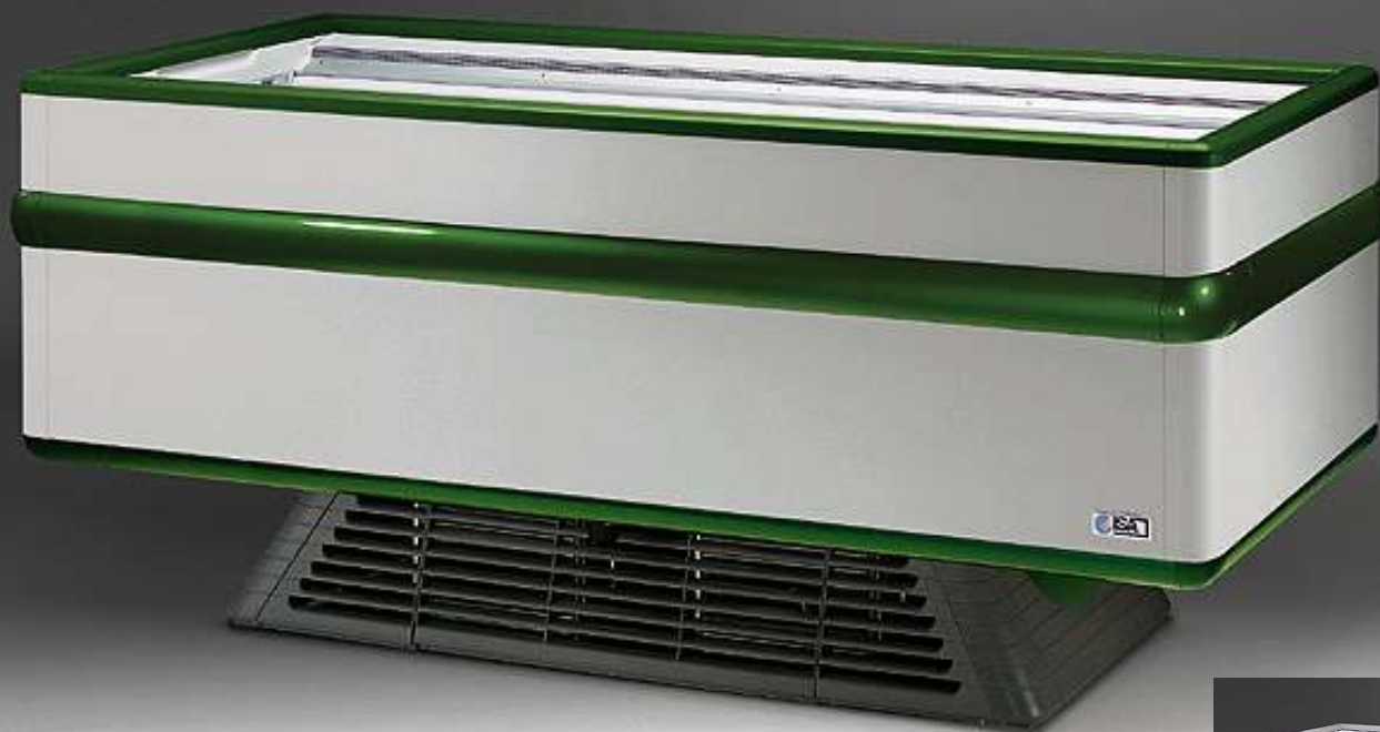
ECOPLINTOS 200 FASHION