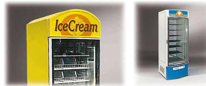
Personalisation on request