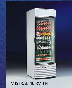
MISTRAL 40 RV TN