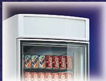
Tempered triple-glazed glass

Internal grid with support (532x410) Mistral 40 RV Internal grid with support (532x505) Mistral 50 RV