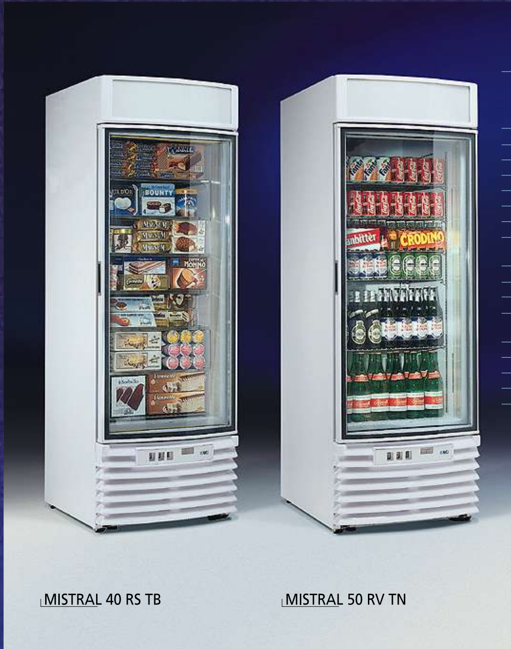
MISTRAL 40 RS TB

High aesthetic quality, high performance and excellent quality make MISTRAL an ideal means to differentiate your offer.