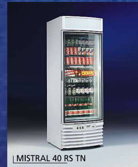
MISTRAL 40 RS TN