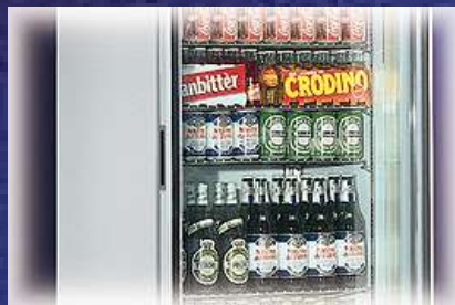
Maximum visibility of the product

Upright showcase with curved door static or ventilated refrigeration suitable for sale of drinks, fresh products, ice-cream and frozen food