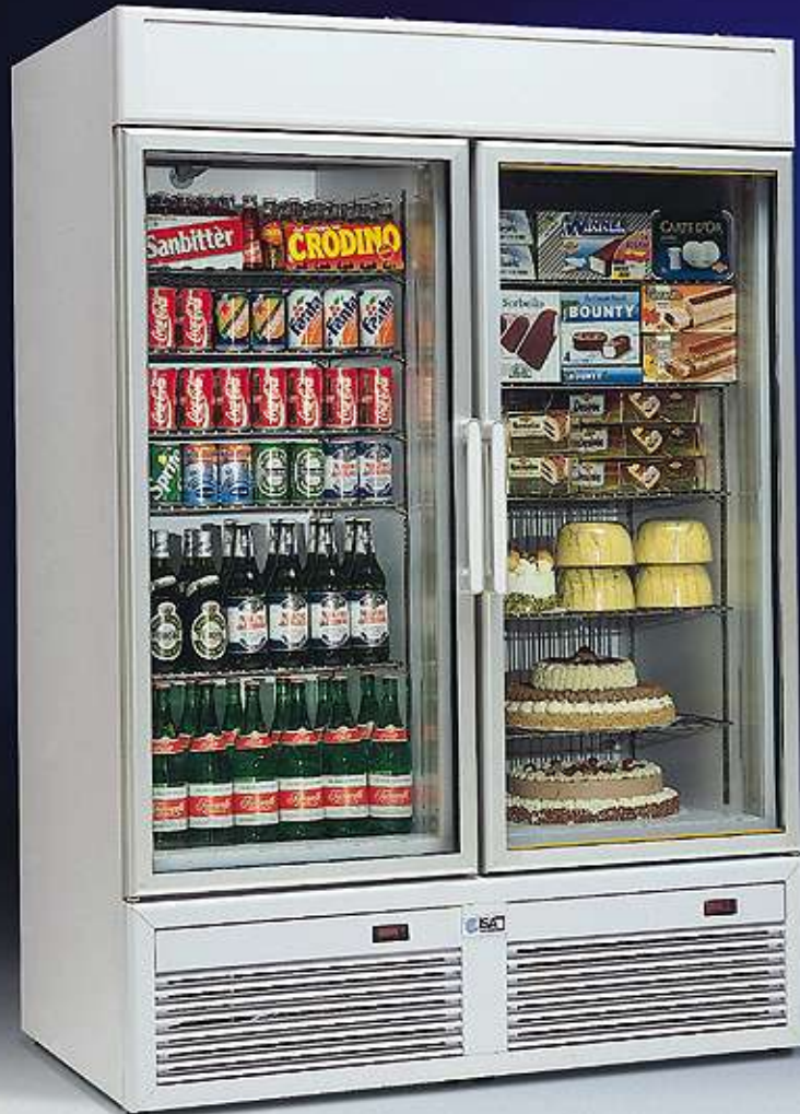
TORNADO 100 RV TN/TB

Modern design, high performance, large display capacity and excellent quality make TORNADO V 100 an ideal means to display and sell your product in the best possible way.