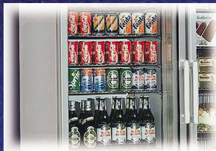
Maximum visibility of the product

Upright display cabinet with double door and ventilated refrigeration suitable for sale of drinks, fresh products, ice-cream or frozen food