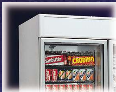
Tempered triple-glazed glass