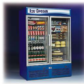
Personalisation on request